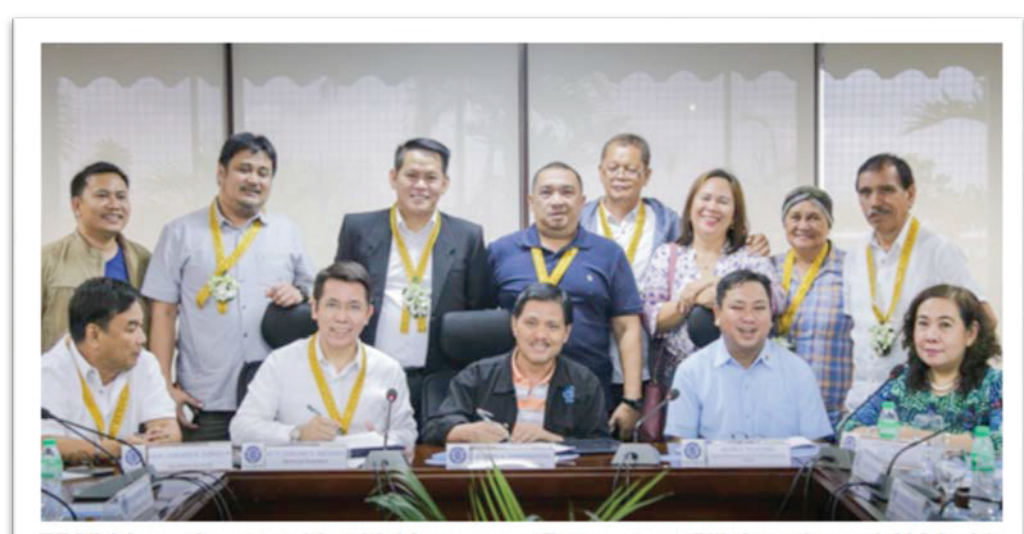
TESDA forged partnership with Liga ng mga Barangay ng Pilipinas through MOA with its National President for the implementation of "Barangay Kasanayan para sa Kabuhayan at Kapayapaan (BKKK)" covering the 42.023 barangays nationwide

This program involves the empowerment of the barangay chairpersons in the identification and nomination of beneficiaries from among their constituents, regardless of political and religious affiliations to avail of free TESDA skills training and scholarship. It aims to provide equal opportunities for the greater number of people in the smallest government unit, the barangay.