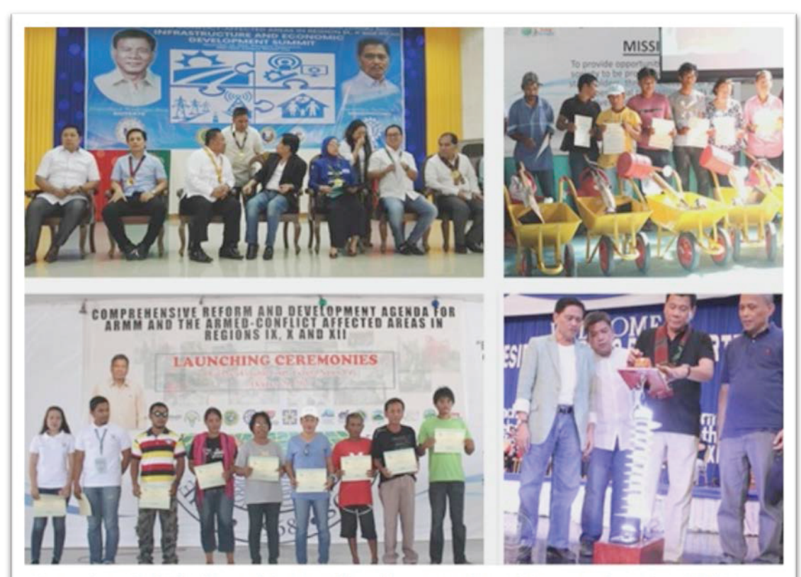
Spearheaded the launching and implementation of Comprehensive Reform and Development Agenda (CRDA) for ARMM and other Conflict-Affected Areas in Regions IX, X and XII.